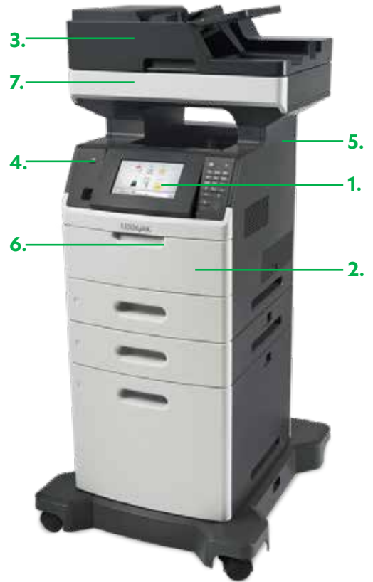
XM5163 model with 550-sheet tray, 2100 sheet tray and caster base

Advanced toner science—powerful enough to deliver consistently outstanding image quality, with a shake-free print system.