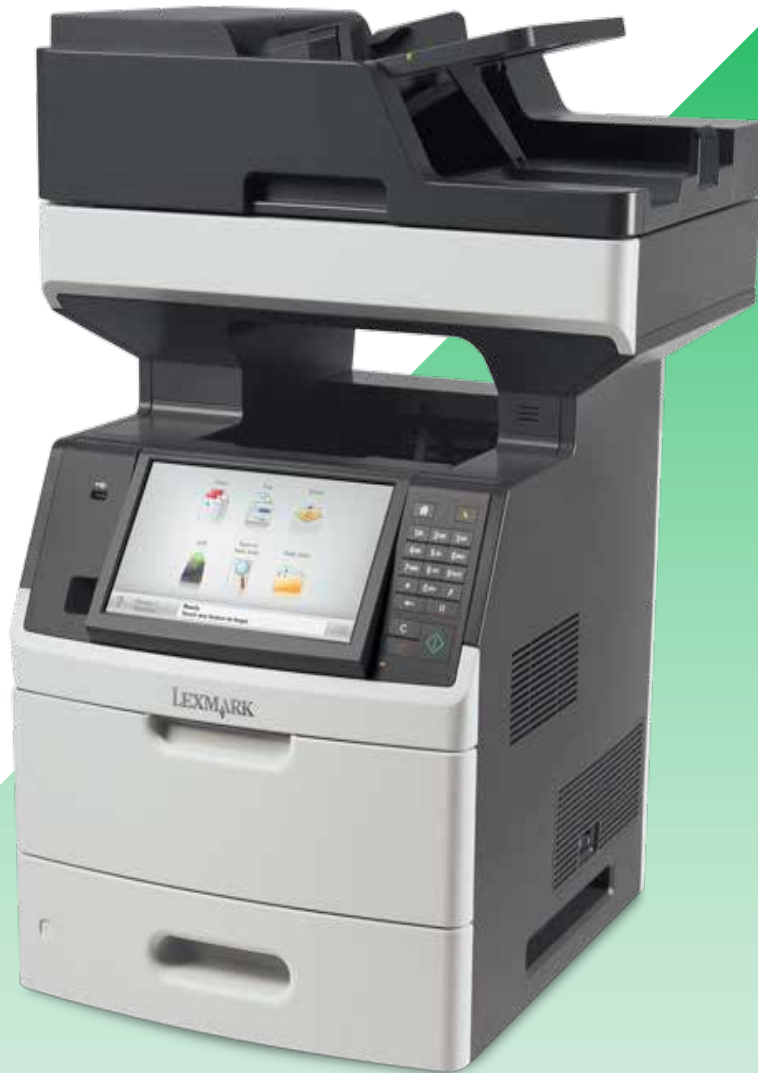
Lexmark XM5170 model